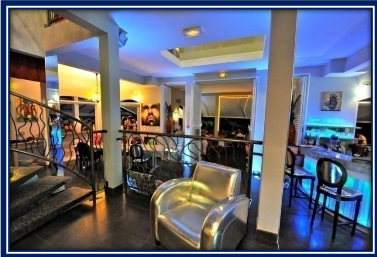
4* La Suite Villa