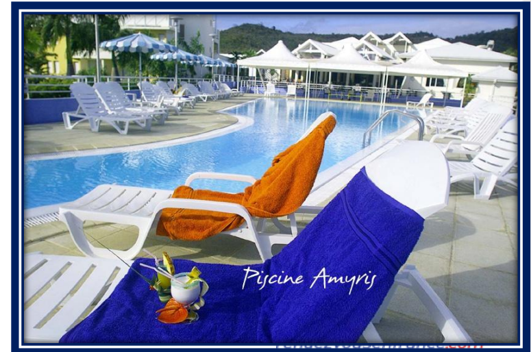
3* Karibéa Resort