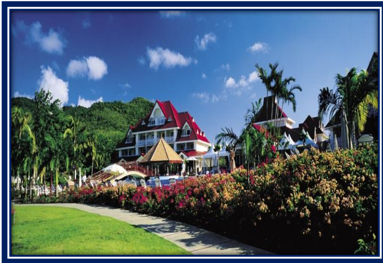
3* Pierre & Vacances Sainte-Luce Resort