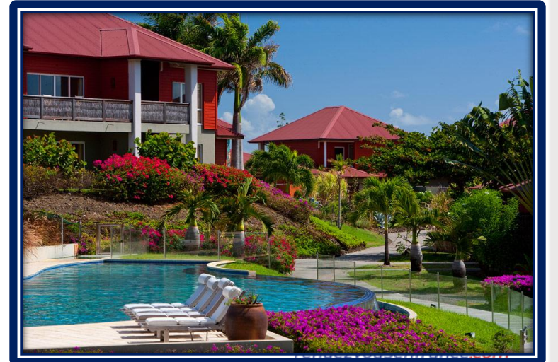
5* Cap Est Lagoon Resort & Spa