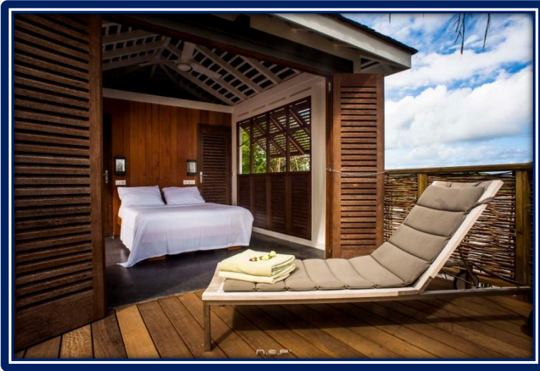
3* Plein Soleil Hotel