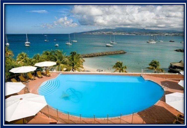
4* MGallery Bakoua